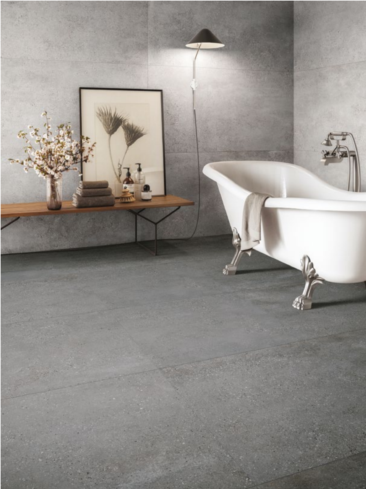
Mold Iron 30 x 60 (special order size)