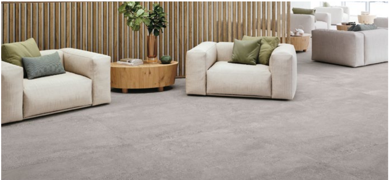
Mold Nickel 48 x 48 (special order size)