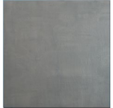
Factory Black 24 x 24