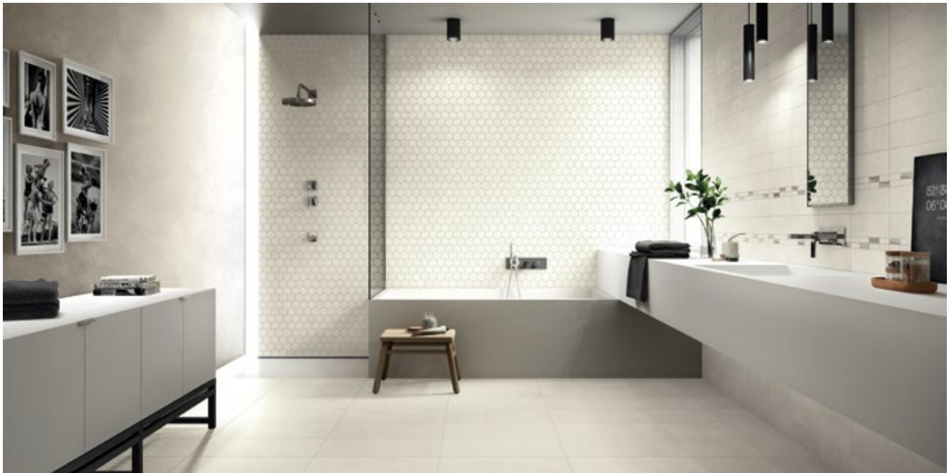
Factory White 12 x 24 Factory White Hexagon w/special order items