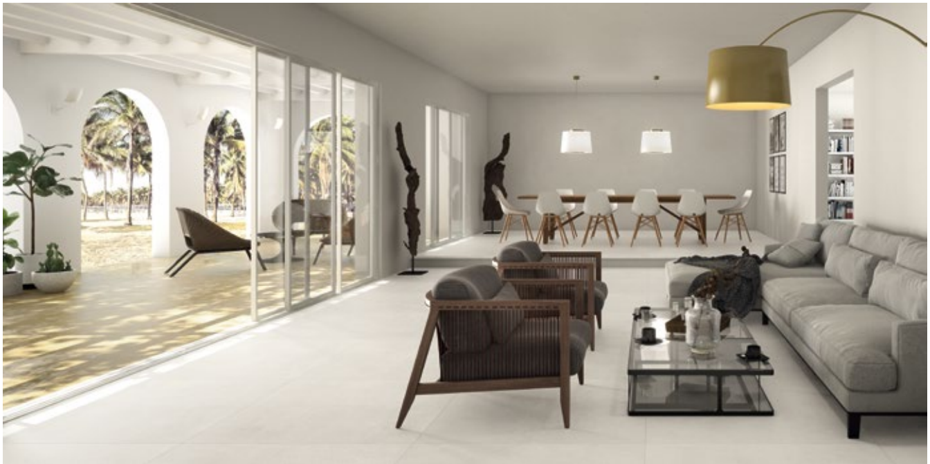
Factory White 40 x 40 (special order size)

Colors and Aesthetical features in this catalogue are to be regarded as indications. Please refer to physical samples for clarification.