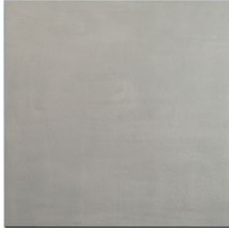
Factory Smoke 24 x 24